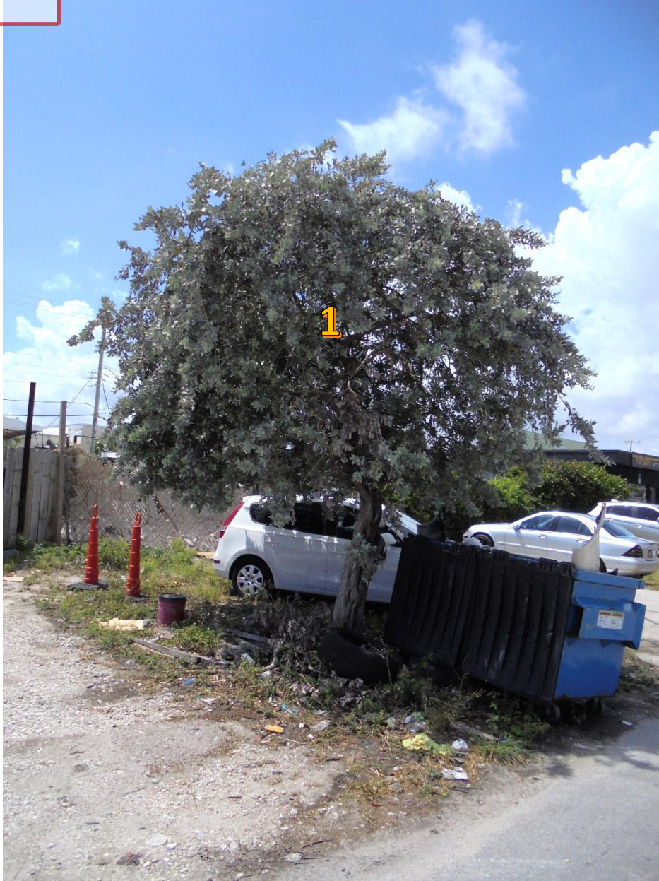
Tree No. 1: Conocarpus erectus var. Common Name: Silver Buttonwood Condition: fair Appraised value: $7,000.00